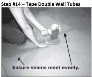
Place cut double wall tubes (Item #C) on ground and match up bottom and top. With tube tightly aligned, tape where top and bottom meet. Tape both sides. Repeat for other tubes.