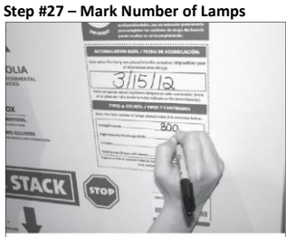
Finalize the Generator's Responsibility section on the container by noting the number of lamps inside the container.