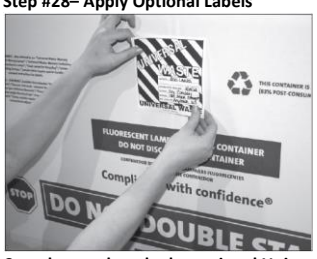
Complete and apply the optional Universal Waste Labels (Item #L) to the container.