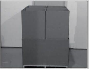
Insert (4) four assembled and taped Half RSC tubes into taped Half RSC Box.