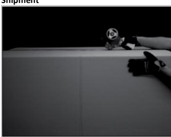
When box is full, close top flaps and seal by taping all seams. Tape using an "H" pattern. Ensure the box is secured to the pallet with shrink-wrap.