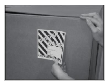
Locate and apply the provided Universal Waste Label. Complete as required.