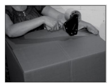
Locate, fold flaps and tape the bottom of all 4 assembled Half RSC tubes (Item #B).