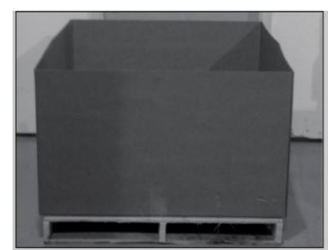
Place the one taped Half RSC Box on a standard 4 foot pallet.