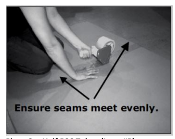
Place Cut Half RSC Tubes (Item #B) on ground and match up bottom and top. With tube tightly aligned, tape where top and bottom meet. Tape both sides. Repeat for other three tubes.