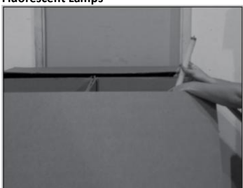
With the top flaps opened. Carefully add intact fluorescent lamps. Keep flaps closed in between filling.