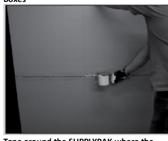
Tape around the SUPPLYPAK where the two Half RSC Boxes meet.