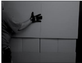
Slide second Half RSC Box (Item#A) over top of the assembled Half RSC Tubes.