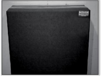
Your SUPPLYPAK container will be delivered in one container. Unpack your SUPPLYPAK Bulk Lamp Recycling Box and take inventory of the component pieces listed to the right.